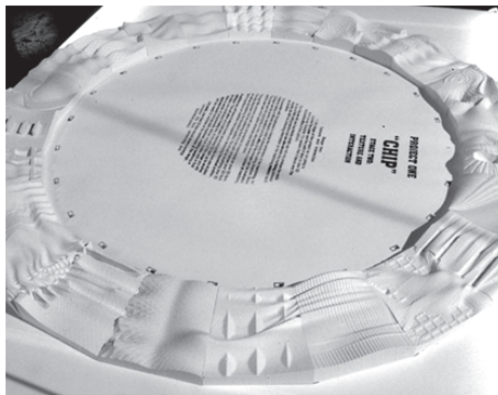
Figure 3: Students radial edge profiles matched together to produce a continuous circular form.